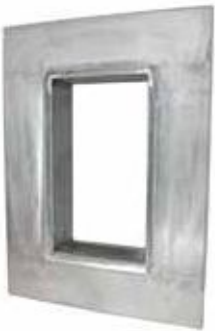
Parts needed for a complete solution

SF-kehykset, haponkestävä ruostumaton teräs ▶ Рама SF, кислотоустойчивая, нержавеющая сталь ▶ SF-ramar, syrafast rostfritt stål ▶ Telaio SF, in acciaio inox resistente agli acidi